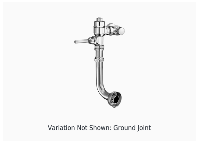
Variation Not Shown: Ground Joint